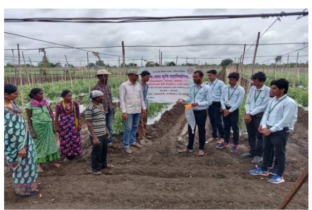
Explaining farmers about lure and its working methodology

Demonstrartion on Use of Beneecial Insect in Agriculture