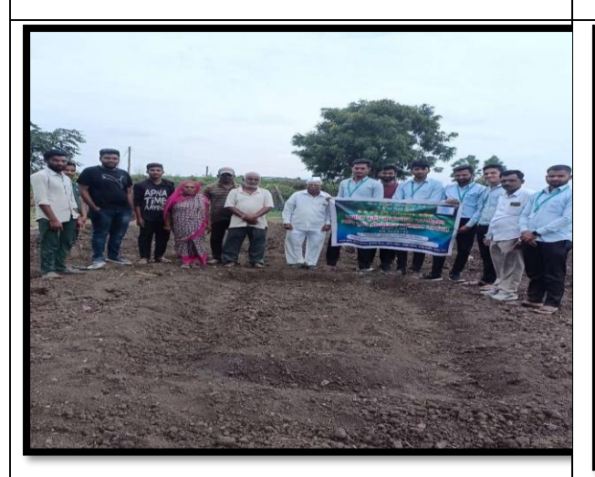
Demonstration on Seed Bed Preparation at Kundewadi 24/08/2023