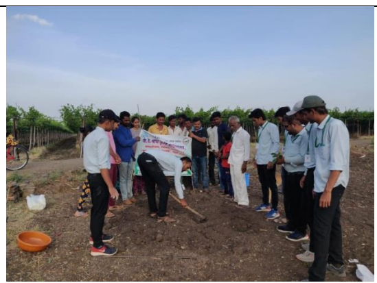
Demonstration on Digging and filling of Pit at Dawachwadi Tal:- Niphad Dist:- Nashik