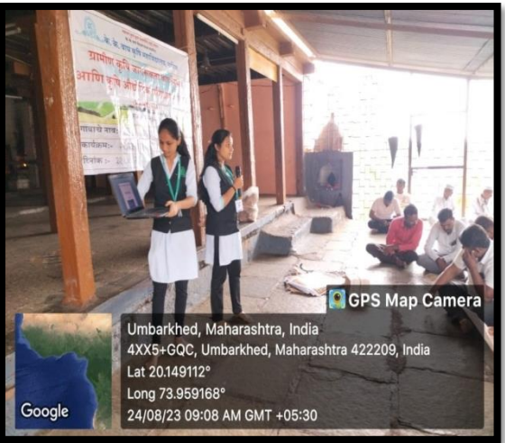
Group discussion on identification of pest and beneficial insects at Umabarkhed 24/08/2023