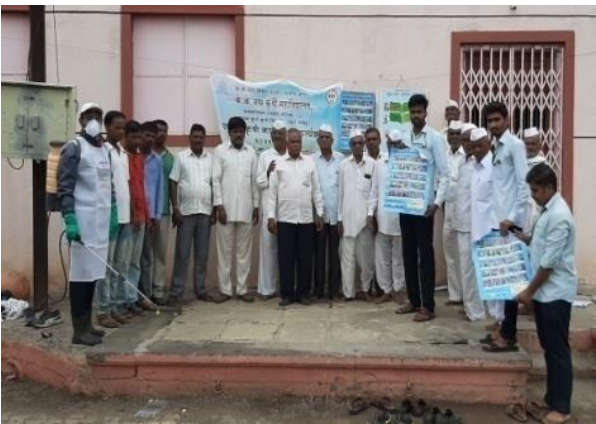
Material required for Safe Handling Insecticides and Pesticides