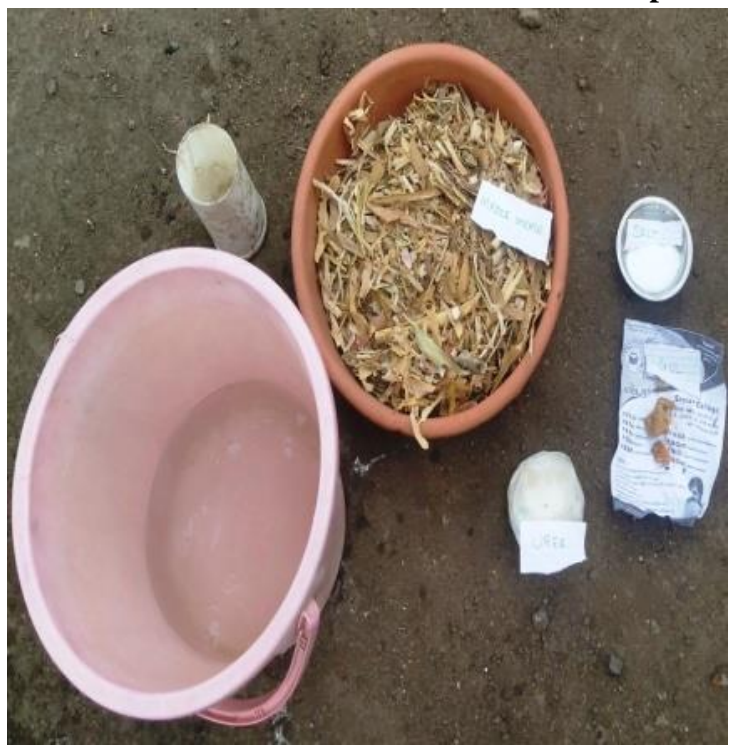
Material required for Fodder Treatment