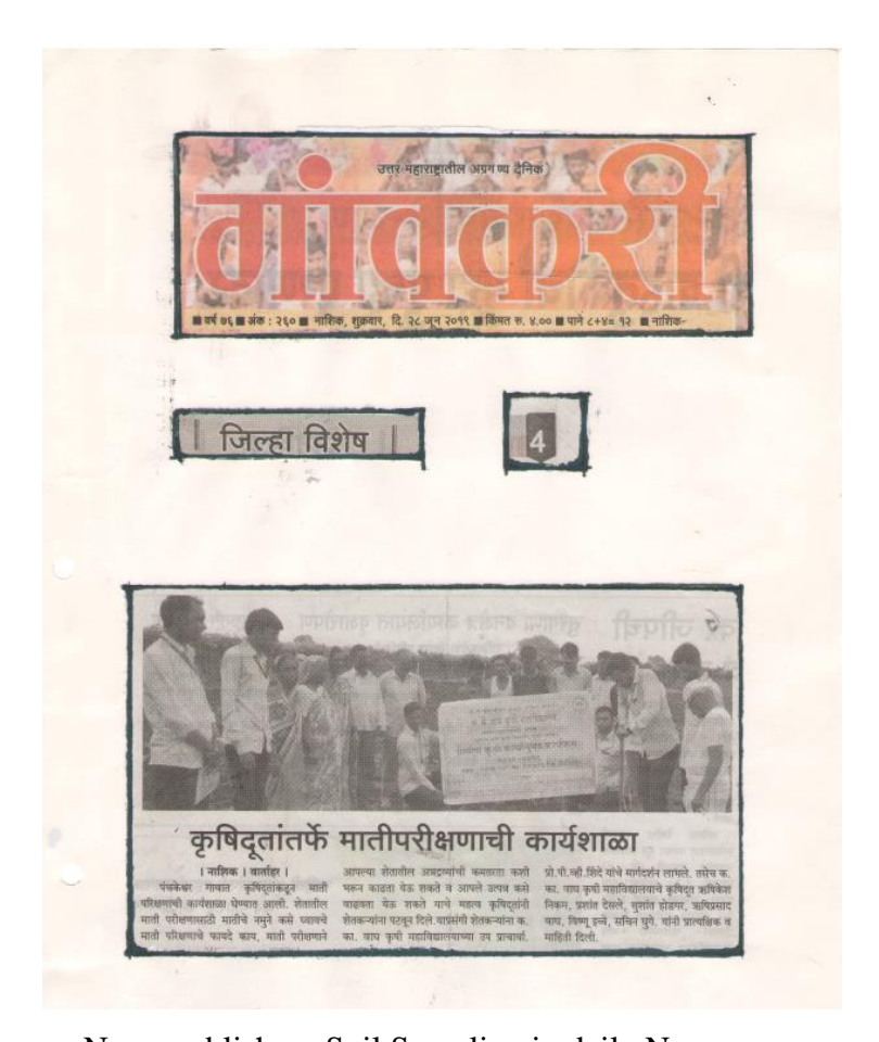
News publish on Soil Sampling in daily Newspaper