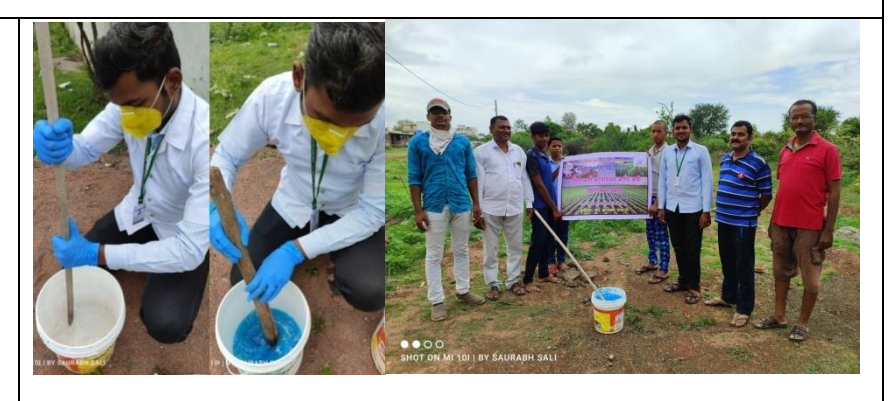
Demonstration on Preparing Bordeaux Paste